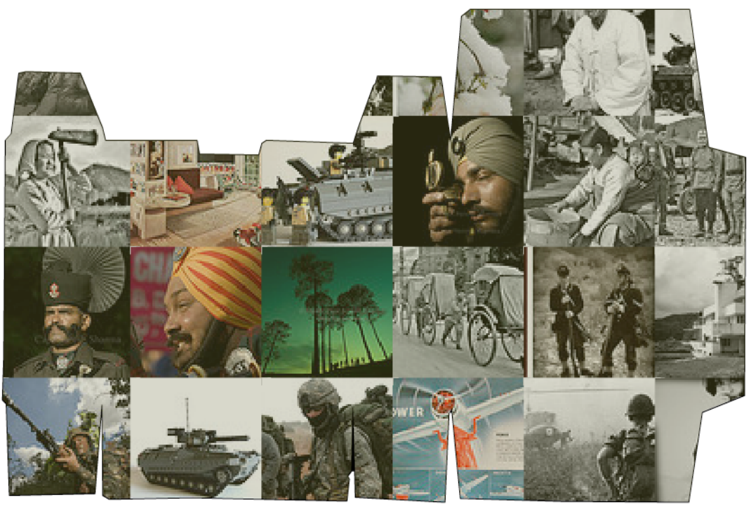
1945, infantry, 3d plugin