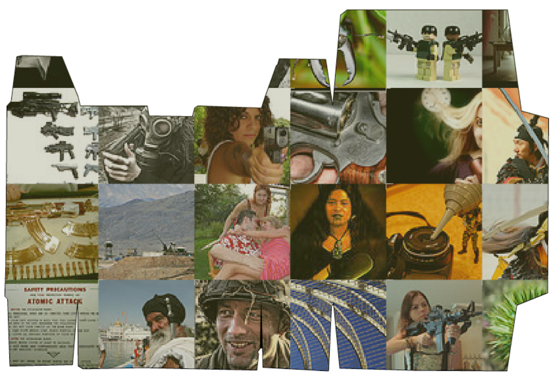
hosttilities, weapons, projectiles