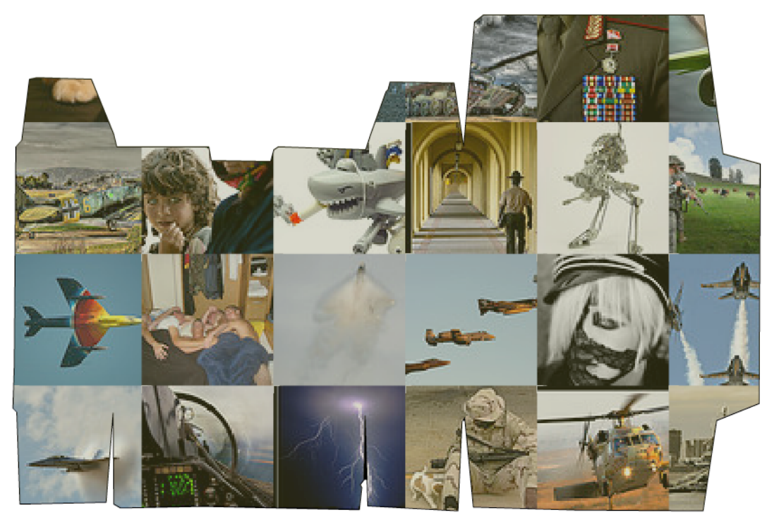
military, thunderbolt, projectiles