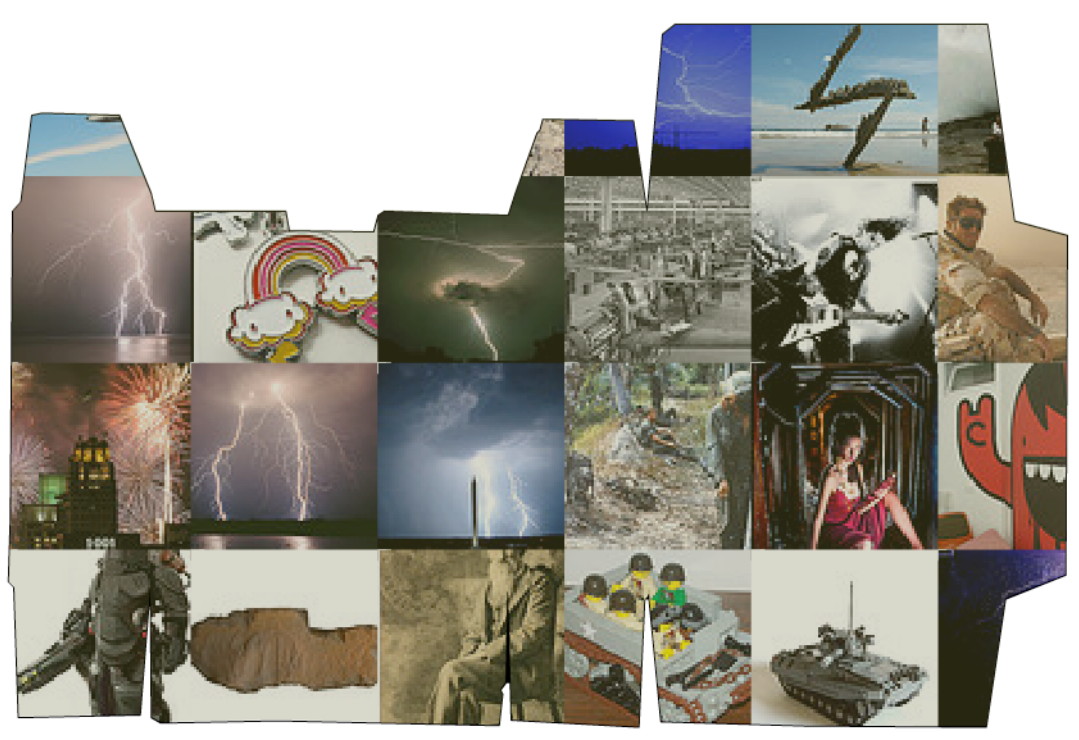
explosive, infantry, thunderbolt