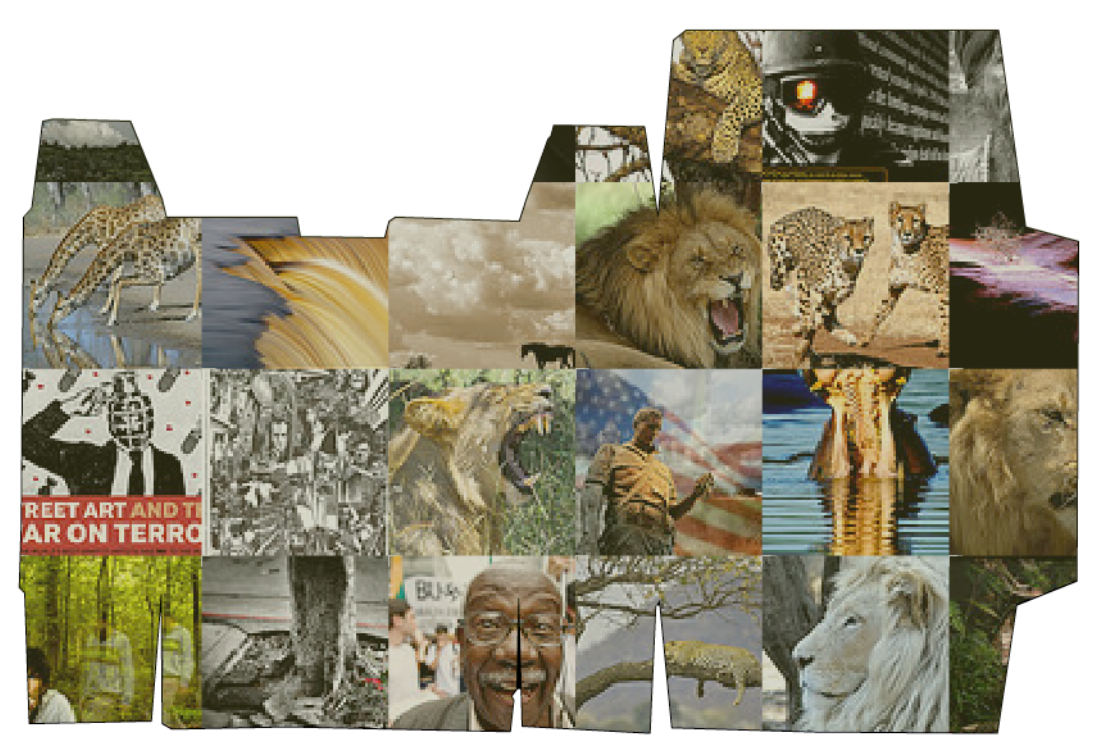
marines, missile, Bush