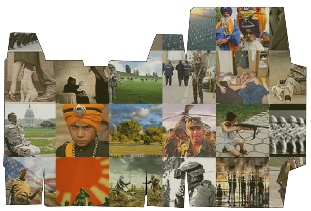
soldier, weapons, officers